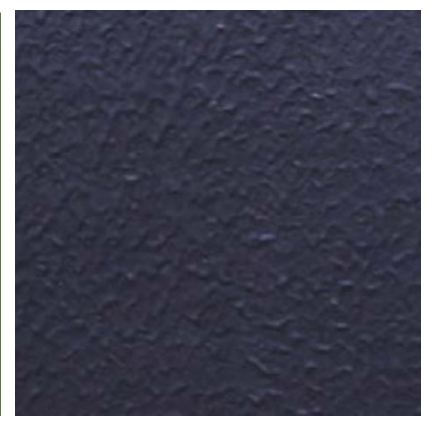
Polished Matt Finish