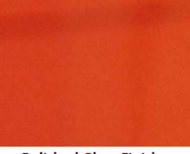
Polished Gloss Finish